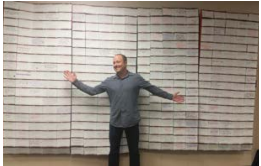
Noted author and speaker, Jay Asher, shares his anti-bullying message with students.