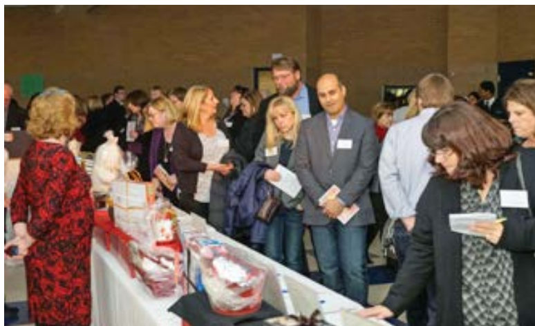
Guests view silent auction items prior to the start of the Night of Fine Dining and Theatre.